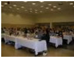
Plenary session attendees hear the keynote address in the Lenhart Ballroom.